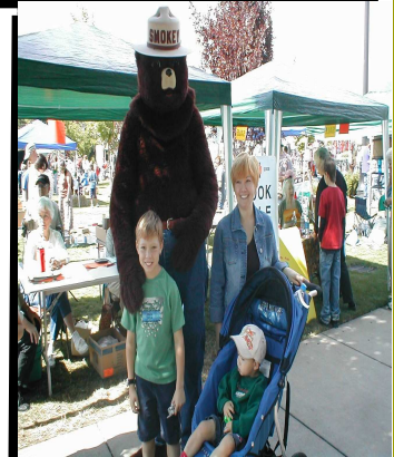
Smokey at the Harvest Festival 2006

See you on the 8th of September at the Festival!